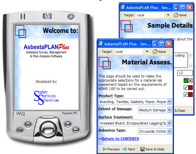
Example Pocket PC Screen shots